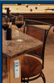
Indoor Humidity & Temperature