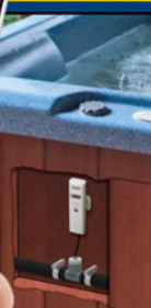
Pool or Spa