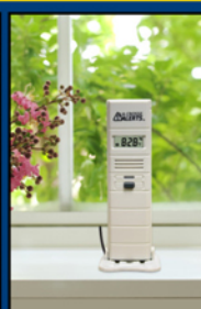
Indoor / Outdoor Temp. & Humidity