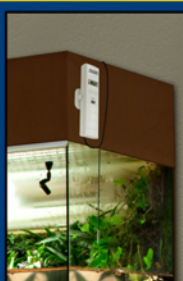
Aquarium or Terrarium